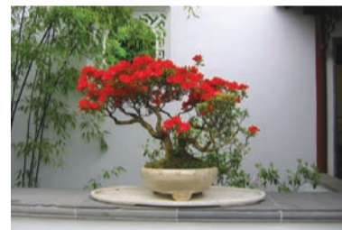
Penjing from Dr. Sun Yat-Sen Classical Garden