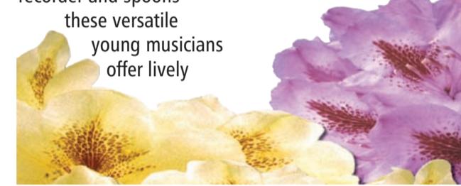
these versatile young musicians offer lively